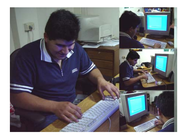
Fig. 1. A blind learner programming with APL

Two major difficulties can be found when blind learners use these languages. First, if they use a pure language they face the issue of verifying the program consistency and the correct reading of command lines. Second, if we provide them current tools to support program construction, they deal with graphical user interfaces. APL intends to close the gap between programming by sighted learners and programming by blind learners.